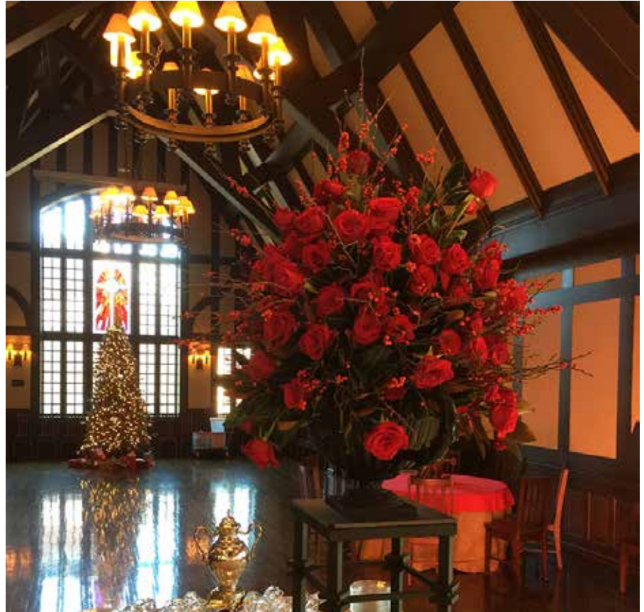
GREAT HALL DECORATED FOR THE HOLIDAY HOUSE TEA. DECORATIONS AND HOMEMADE COOKIES PROVIDED BY VOLUNTEERS.

Over the past 5 years alone, the tour has welcomed 10,000 plus visitors, organized 1,300 volunteers, hosted 28 homes, condominiums, or businesses, served over 6,000 finger sandwiches, baked countless homemade snacks from our very own Holiday House Cookbook, tied hundreds of bows, hung lots of garland, and raised over $150,000 in proceeds. The monies raised by The Holiday House tour provide addi-