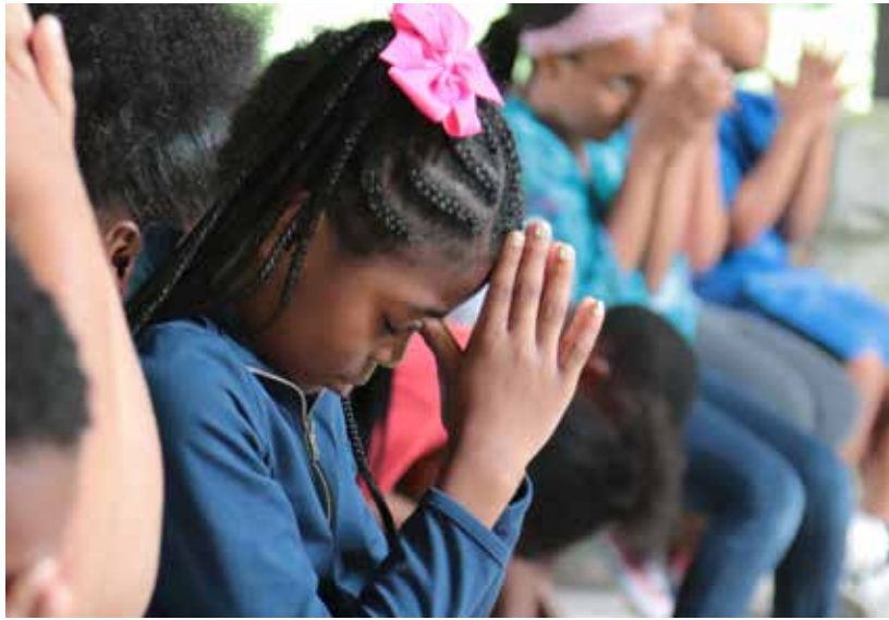
STUDENTS BOWING THEIR HEADS IN PRAYER DURING CHAPEL, WHICH THE CHILDREN ATTEND DAILY.