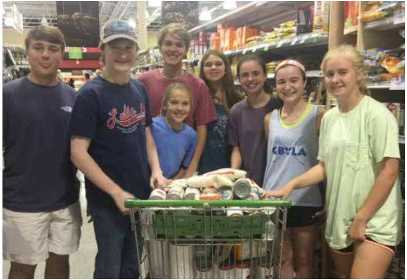
YOUTH HELPING TO STOCK THE IPC FOOD PANTRY THROUGH THE ANNUAL YOUTH PANTRY STOCK

Even more, your pledge is an expression of faith . From the beginning of his ministry on Earth, Jesus has depended upon disciples to spread the gospel. Your pledge is your response to the call of Jesus Christ so that God's word may continue to be heard in our city and is the means by which good works may be done in Christ's name. Finally, your pledge is an act of devotion . Love is expressed in many ways. Your pledge is one way for you to show your love for our gracious God and the body of Christ known as IPC. As you consider your pledge for 2019, I ask that you think on these things and pray about how you may share in the call of God to IPC.