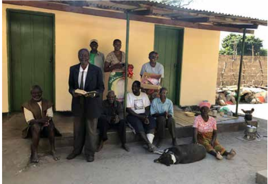
MISSION TEAM STOPPED TO SAY GOODBYE TO RESIDENTS OF KANDIANA WHERE THEY PAINTED FOUR BUILDINGS. ONE MAN PUT ON HIS SUIT AND GOT HIS BIBLE FOR THE PICTURE.

For the 2018 Team, there were many special moments. On our last day, we stopped to say our goodbyes at Kandiana, the elderly orphan's home where we'd painted exteriors of four buildings. Before gathering for a photograph, the oldest resident, a blind man, went into his room and put on a coat and tie and came back proudly