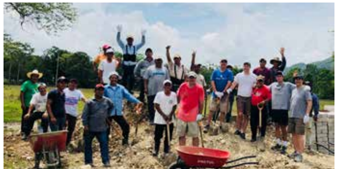
Working on the foundation for the new building