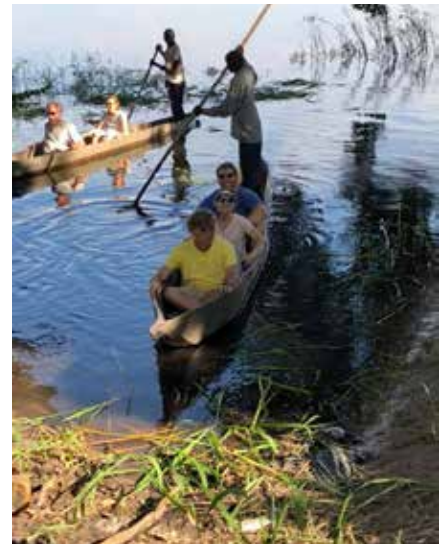
RIDING IN MAKORO, A TRADITIONAL ZAMBIAN DUGOUT CANOE USED DAILY ON A TRIBUTARY OF THE ZAMBEZI RIVER