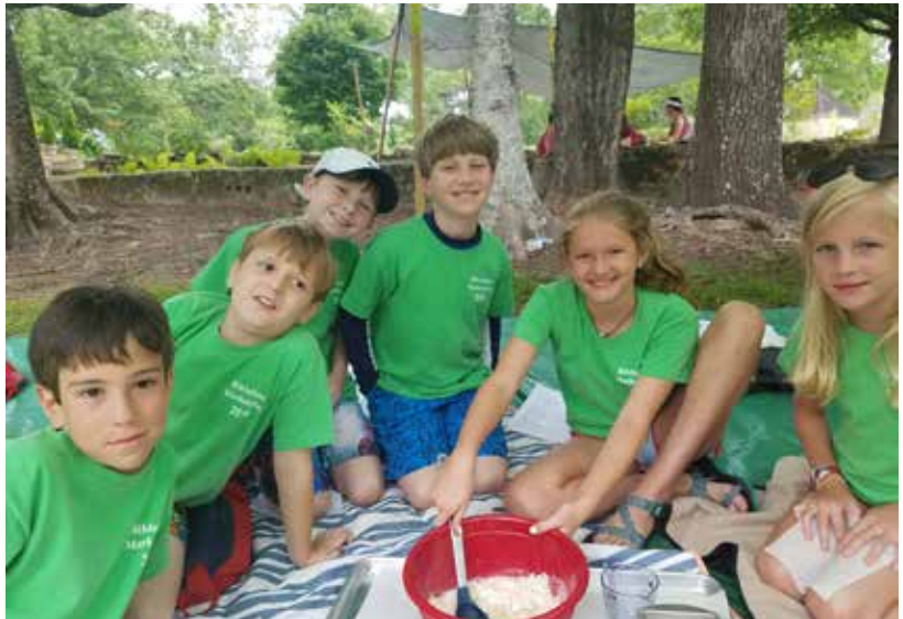
BIBLETIMES MARKETPLACE CAMPERS MAKING BREAD