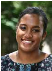
Halle Hill Scholar in Residence Read more on PG 7

The Window is a quarterly publication of Independent Presbyterian Church 3100 Highland Avenue South. The Window is published for church members and friends.