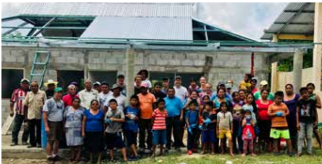
Painting a new building alongside members from the Ruiz Cortines church