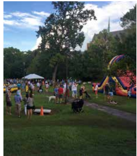
THE RUSH IN 2016 AT GARDEN SITE TO RAISE MONEY FOR THE PROJECT

ABOUT THE GARDEN ArchitectureWorks designed the garden space. Twenty-four plots will be