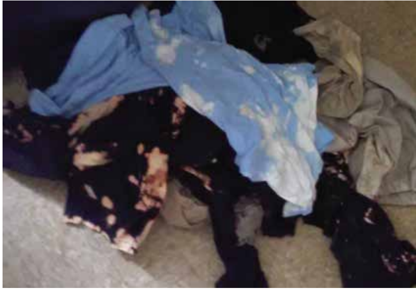
THE BLEACHED UNIFORMS. LEARN HOW PMUAB GIFTS HELP THE FUND, KIRKWOOD BY THE RIVER, AND LIVING RIVER JUNE 10 AT 11 AM WORSHIP