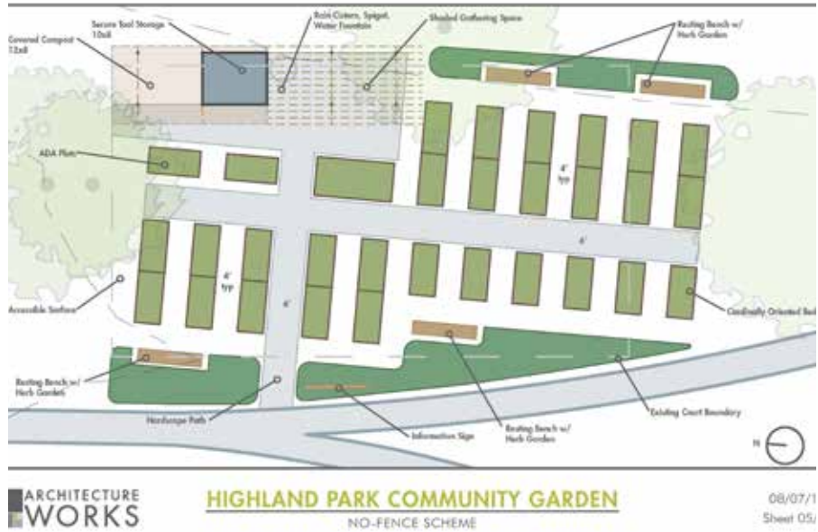
ARCHITECTURE WORKS HIGHLAND PARK COMMUNITY GARDEN NO-FENCE SCHEME 08/07/18 Sheet 05/ RENDERINGS OF THE HIGHLAND PARK COMMUNITY GARDEN IN RUSHTON PARK COMING SUMMER 2018

When I was approached by David Seamon to help Independent Presbyterian Church launch the Highland Park Community Gardens, I was thrilled. I couldn't think of a more natural extension of our neighborhood's innate sense of community than a community garden. Beyond that, though, there's a real need for land in Highland Park. We live in the most densely populated neighborhood in the state. Moreover, many of our residents live in apartment rentals with few to no private outdoor areas. Our city parks mean a lot to us. That we can transform an unused bit of space in one of our parks into a beautiful, productive public project is exciting. That it will also be the very first community garden in a Birmingham city park is an honor. For our neighborhood, this garden means greater fellowship, stronger community ties, and, of course, more amazing food. It is a place for us to not only gather but work together to produce something of value for others.