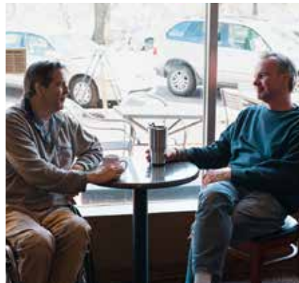
NEIGHBORS GATHER FOR COFFEE, CONVERSATION

We hope it will also be a place to inspire. That the unique sense of community in Highland Park will bear a community garden that ignites repetition city parks throughout town. That a thriving community garden in a city park will be commonplace. That neighborhoods that gather, work together, and grow will become an unspoken ritual of a city that loves itself.