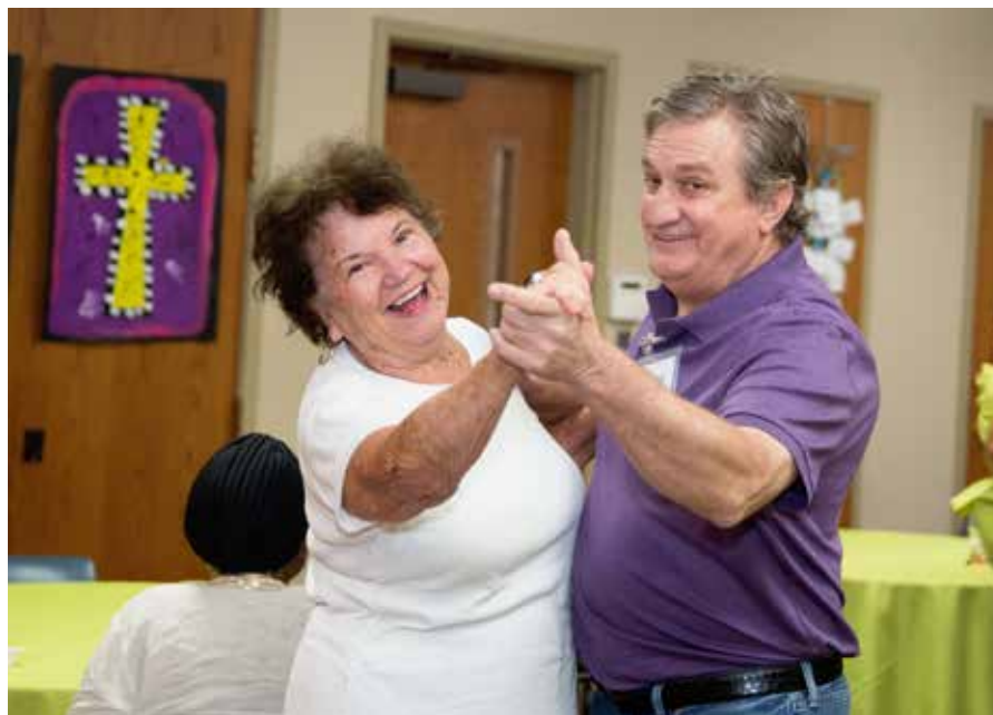
RECESS MODELED AFTER FIRST UMC (MONTGOMERY) RESPITE MINISTRY

This isn’t your typical recess. Trained staff and volunteers will lead activities and eat lunch with participants living with mild to moderate memory loss on Tuesdays and Thursdays in Highland Hall from