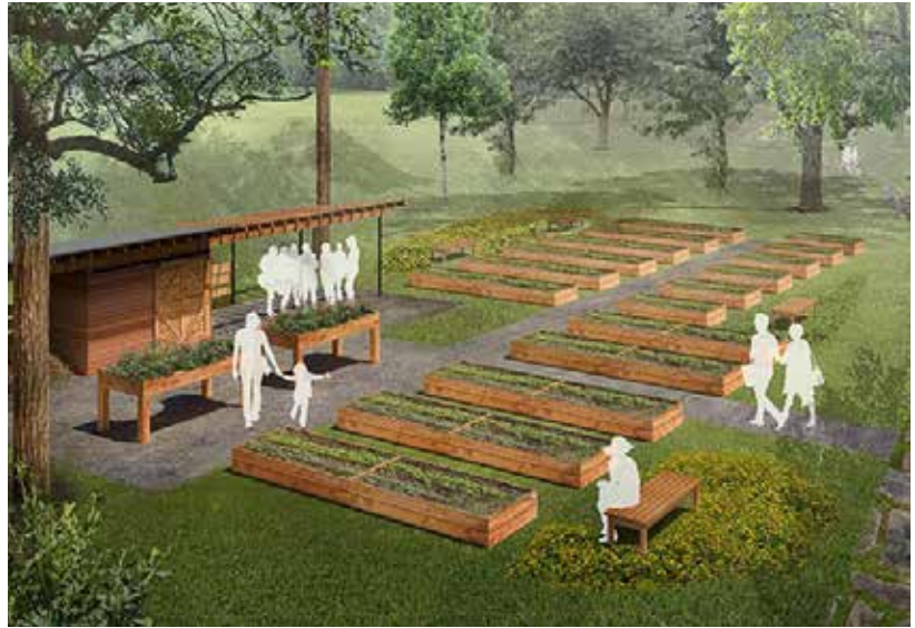
ARCHITECTURE WORKS RENDERING OF HIGHLAND PARK COMMUNITY GARDEN COMING MAY 2020