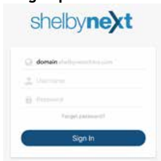
SCREENSHOT OF SHELBYNEXT APP

Look for information in upcoming eUpdates.