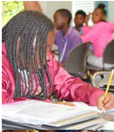
STUDENTS WORKING UPSTAIRS IN A NEW CLASSROOM CREATED FOR THEM.