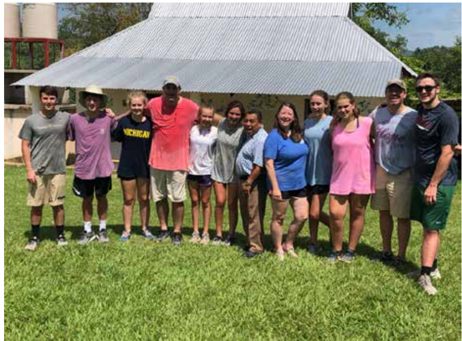
FIRST RECENT YOUTH GLOBAL MISSION TEAM HELPING TO FINISH SUNDAY SCHOOL CLASSROOMS IN CHIAPAS, MEXICO.

We have improved our counting of "Lost Sheep" and of the faithful, as well as improved communications through our family email. We are continuing to prioritize the most important thing – faith development.