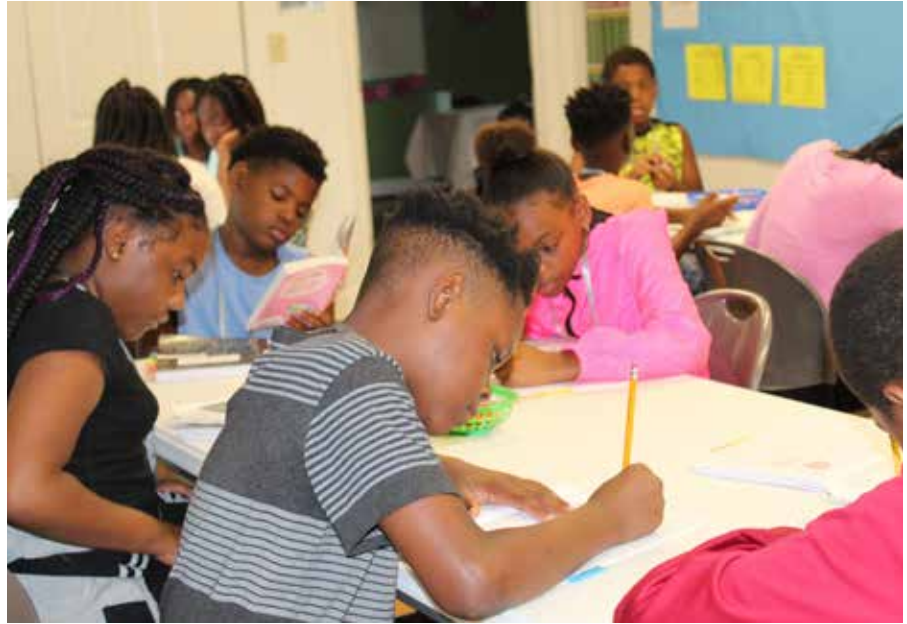
THE SUMMER LEARNING PROGRAM'S FIRST SIXTH GRADE CLASS CREATING BUSINESS PROPOSALS.

I am so thankful to be given the opportunity to love, laugh and learn with these students again this summer. Last summer, these amazing kids changed my life. I watched as they grew in their confidence, strength, faith and academics. Their silly jokes, determination to succeed, love for