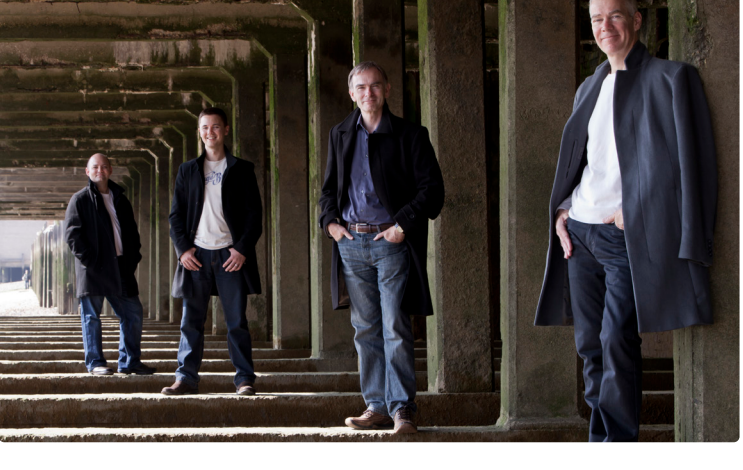
FRIDAY, FEB 3 Sanctuary • 7 p.m.