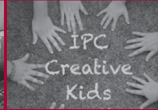
Events pgs. 4- 5