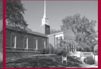
Highland Hall Project pg. 8