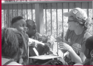
PMUAB Appeal pg. 3